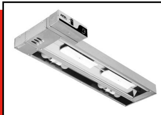
C*RADIANT™ LIGHTED SINGLE OVERHEAD